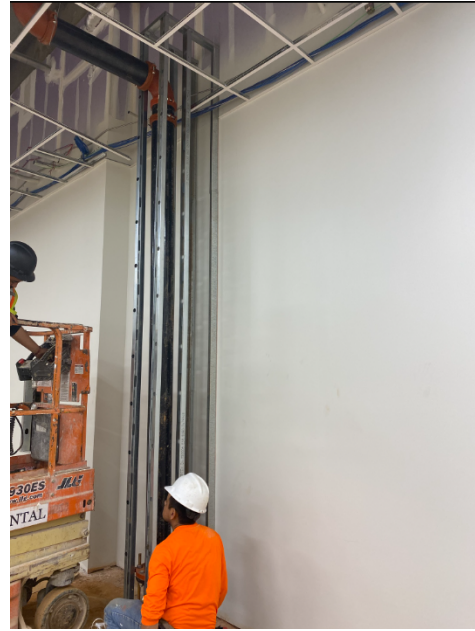
Begin metal stud framing for fire riser in the flex room