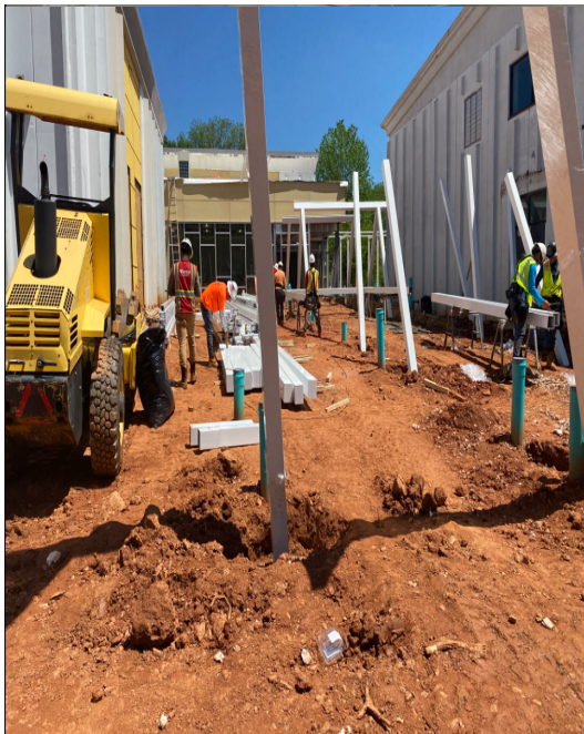
Begin installing canopies at the security vestibule