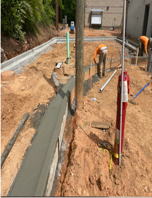
Begin curb and gutter construction for the dumpster pad